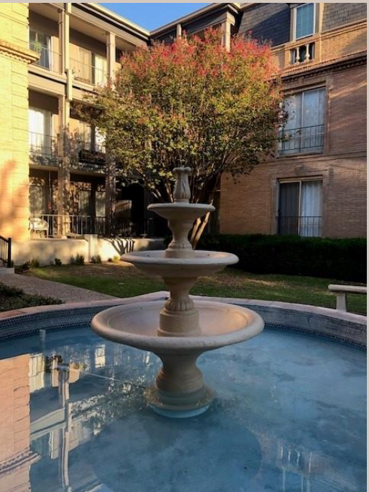
Power washed & Painted Fountain